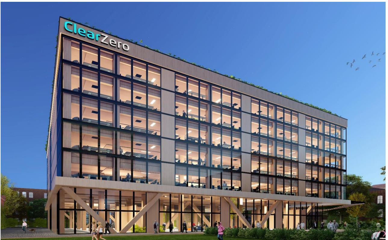
Artist's impression of ClearZero Archetype (rear view).