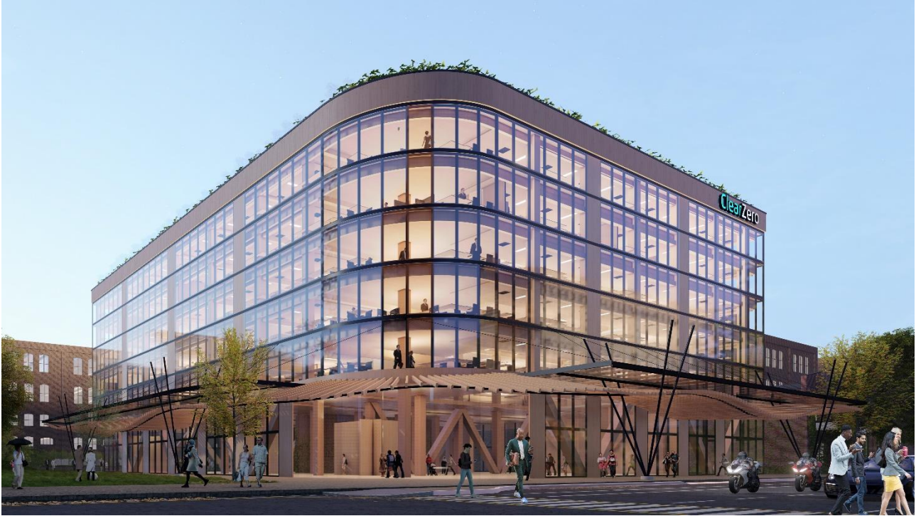
Artist's impression of ClearZero Archetype (front view).