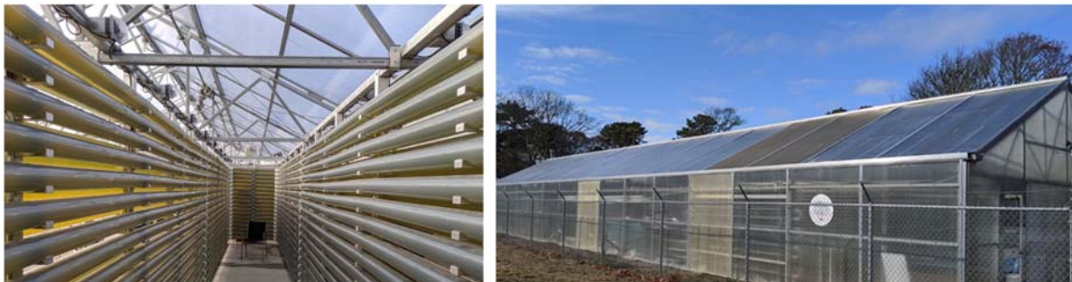
Photos of existing Aquagen Waste Treatment Greenhouse, Cape Cod, Massachusetts USA

ClearVue's IGU panels have recently been delivered to Aquagen with installation expected to commence within coming weeks. Subject to successful demonstration in this greenhouse trial, Aquagen anticipates the combined ClearVue and Aquagen solution to be implemented into a proposed larger STEM educational facility project at the school.