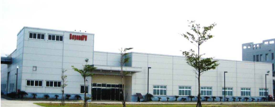
BeyondPV factory in Tainan, Taiwan (R.O.C.)

The OEM Supply Agreement is to be finalised and signed within 60 days.