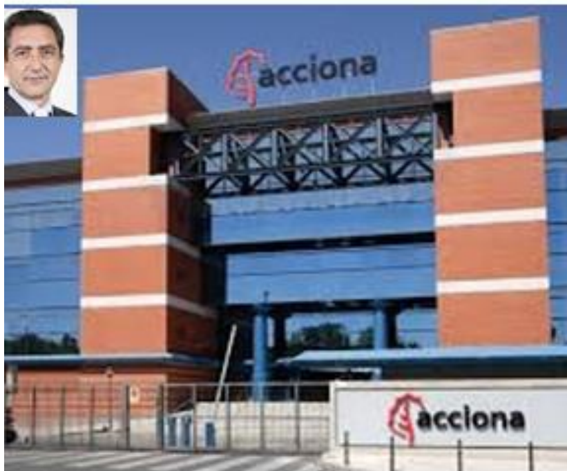
Acciona's Energy Efficiency Division in Madrid -La Moraleja Spain

ClearVue is to now deliver a product sample to ACCIONA for testing with a view to both parties then exploring a relationship.