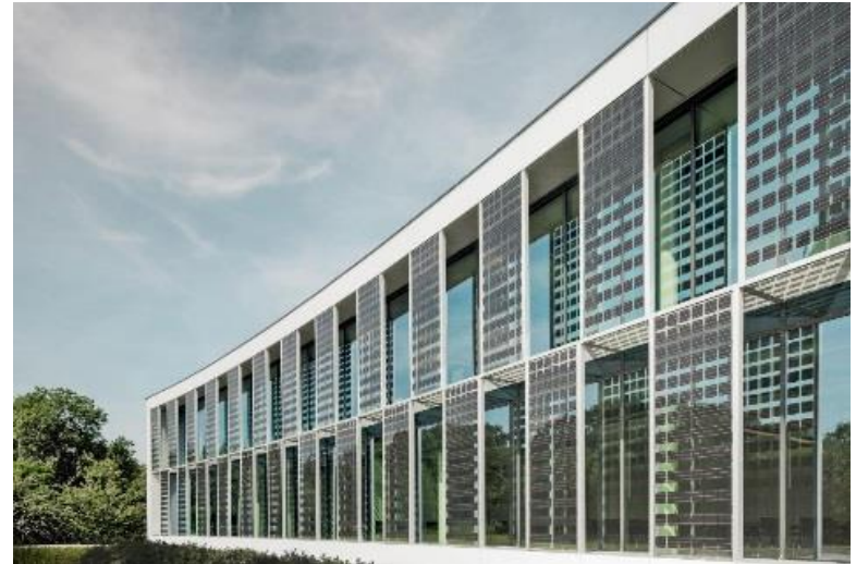
AGC R&D Technology Centre in Louvain

AGC is investigating the required product specifications to meet ClearVue's needs.