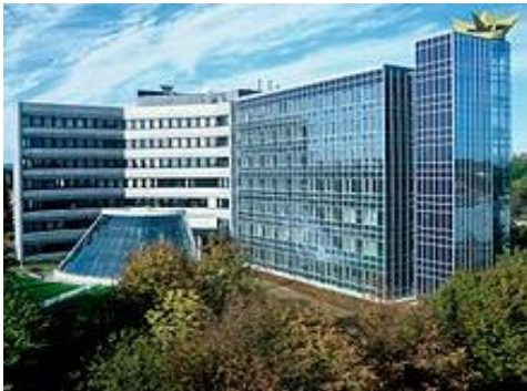
Schüco's headquarters in Bielefeld